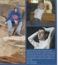
1/6 page ad format with 2 vertical photos