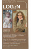
1/6 page ad format with 2 vertical photos in 1:1 square photo