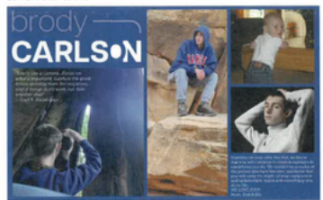
1/2 page ad format with 4 photos with varying sizes

All examples are proportional, but not the correct size